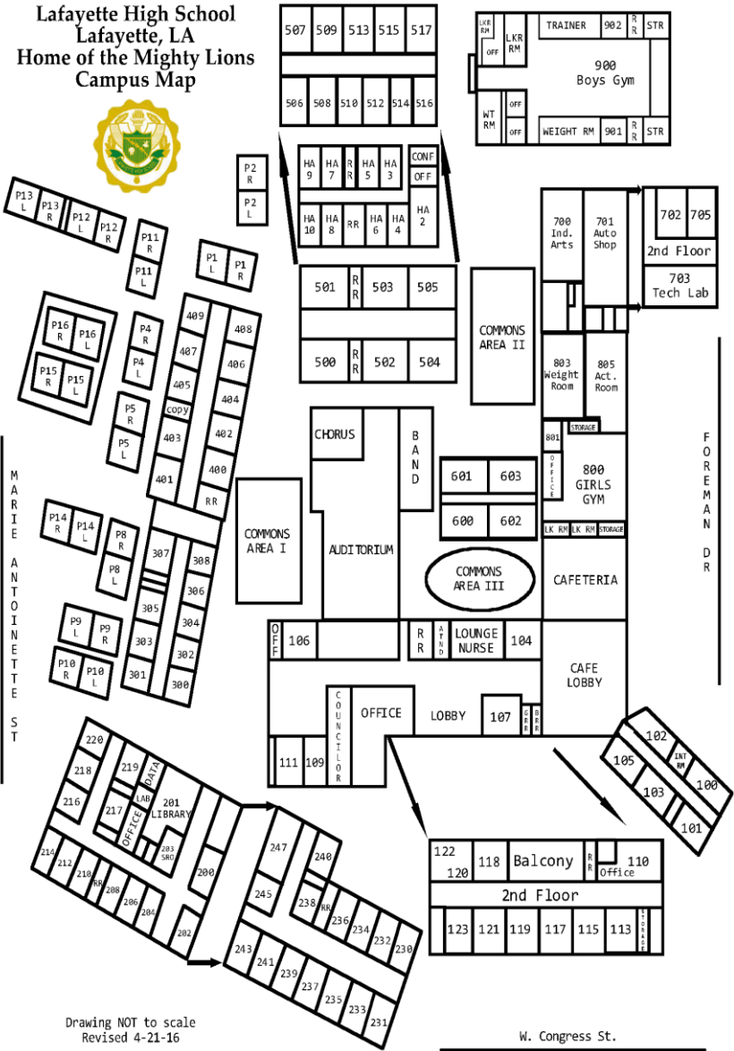
Drawing NOT to scale Revised 4-21-16